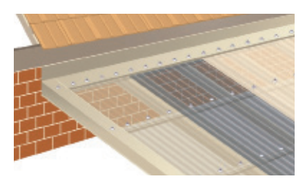
AGAINST A WALL/FASCIA - Fit metal barge capping to edge of sheet and metal apron flashing at the wall or fascia.

UNDER A GUTTER - Fit back channel flashing with foam infill strips under gutter prior to laying sheets and metal barge capping to edge of sheet.